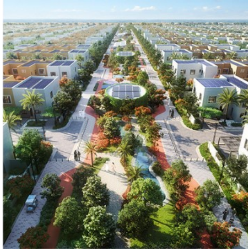
Sharjah Sustainable City