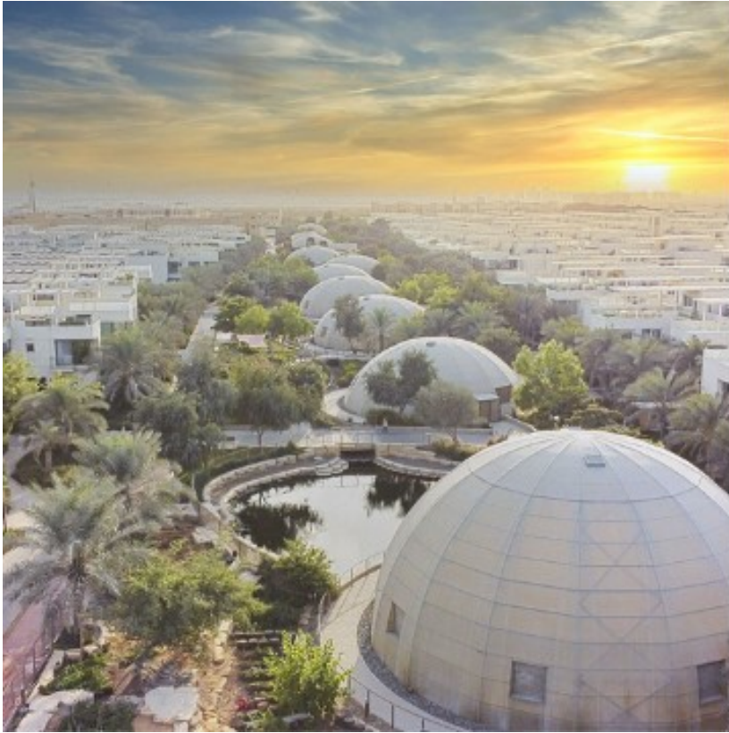
Dubai Sustainable City

Research, explore and learn about sustainable cities.